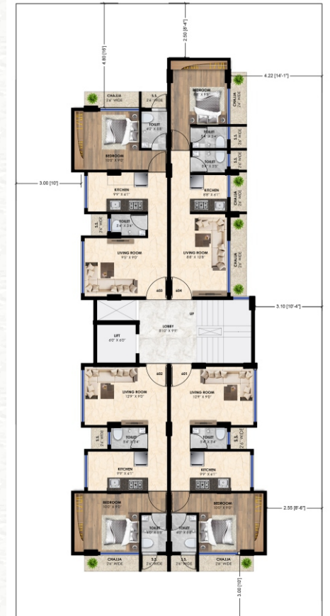
Sixth Floor Plan