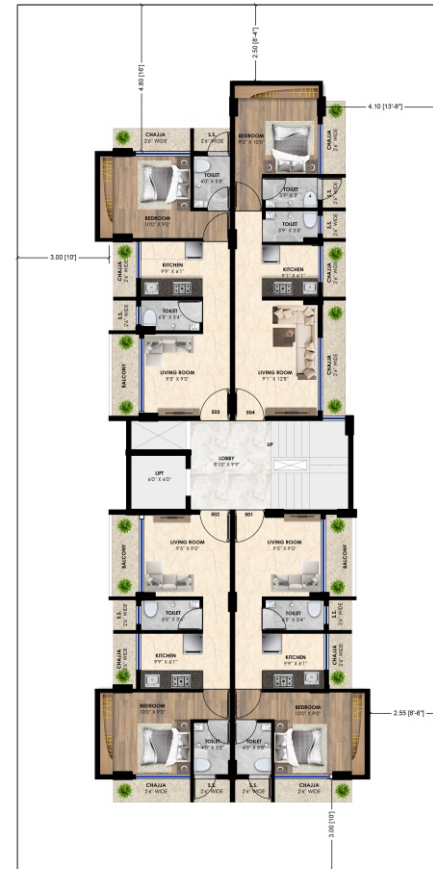
Fifth Floor Plan