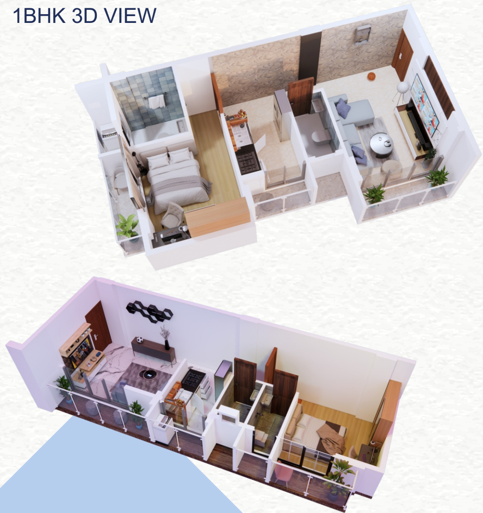
1BHK 3D VIEW