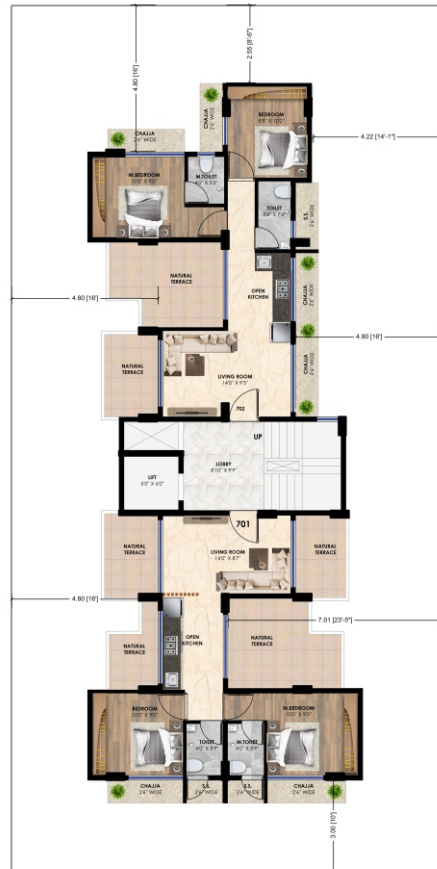
Seventh Floor Plan