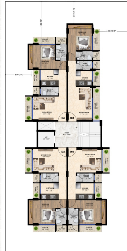
First to Fourth Floor Plan